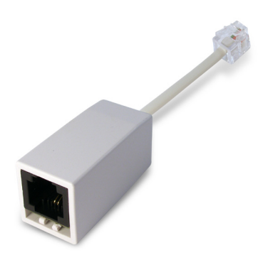
The in-line DSL nanoFILTER