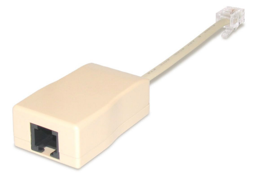
CP-260HPF PSTN Blocker